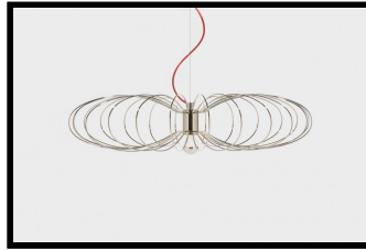
266 FLYING SPIDER